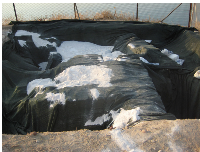
Trench lined and back-filled for preservation