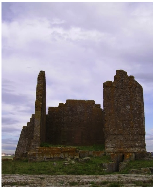
Temple at Gabii

This meant we spent three weeks going on daily field trips in Rome and beyond. Many of the most memorable sites were up in the Appenines, such as Alba Fucens, a Latin colony high in the mountains of Abruzzo. Alba is best known for being the prison of the last Macedonian king, Perseus (second century BCE) and the hometown of Tiberius' menacing Praetorian prefect, Macro. Also spectacular was the town of Norba, another Latin colony, overlooking the Pomptine plain and reached by a vertiginous drive up a winding mountain road. There was also plenty of time spent in the Roman Fora and the Campus Martius, trying to understand the complexities of Roman topography and geology (a very important topic for understanding the construction of Rome next to such a flood-prone river). The three weeks were an excellent opportunity to get to enjoy the wonderful intellectual atmosphere at the Academy and to become friends with fellow graduate students from across the United States.