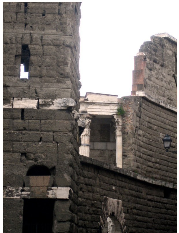
View of columns of the temple of Mars Ultor from behind a tufa firewall

I would not have been able to conduct the project on this level had it not been for the generous grant provided by the Segal Fellowship, and I thank the foundation and all who were involved with the award that allowed me to carry out this research.