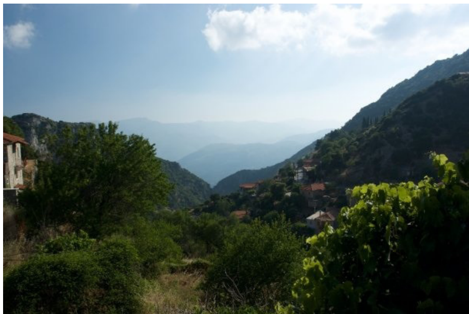
A view of Stemnitsa, Arcadia