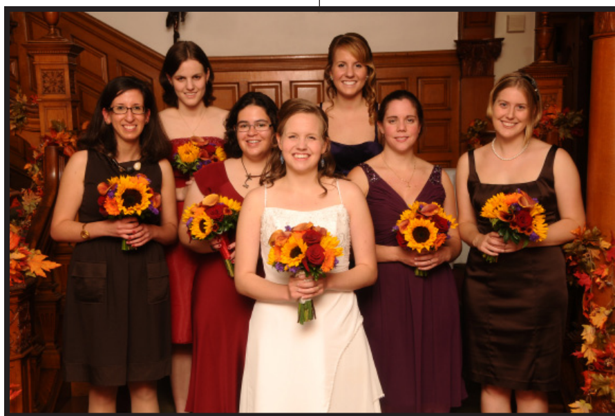
Bridesmaids from left to right: