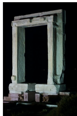
Temple of Delian Apollo, Naxos