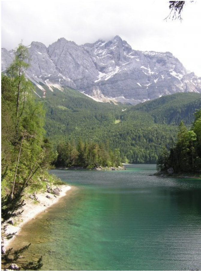
View of the Alps