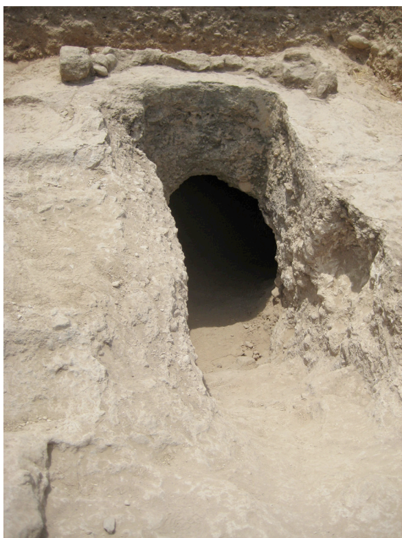
Roman chamber tomb entrance

various other uses and occupations from Classical Greece through the Ottoman period. This season, we concentrated on excavating one Roman chamber tomb, one area of hillside possibly once home to a defensive wall, and one residential building from late antiquity. I was able to participate in each of those sub-projects and overall got a solid introduction to the practices of archaeology in the field, including the digging itself, cleaning and cataloging the various artifacts, including a section of a decorative floor mosaic preserved in situ , the various methods of documenting the excavations and the finds, and the process of stabilizing and preserving excavated structures. In spare time, I sampled the local food and wine and visited a variety of other sites of archaeological interest in the vicinity of ancient Corinth, including Epidauros, where I took in a performance of the Alcestis , and Athens, where I saw the new Acropolis Museum soon after its opening. I am extremely grateful to the Harvard Department of the Classics for its generous support of this trip.